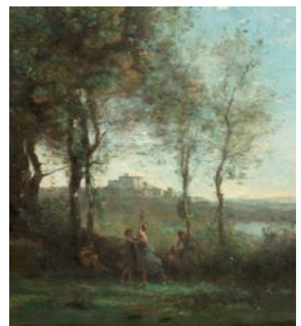
JEAN-BAPTISTE CAMILLE COROT Les danseurs de Castel-Gandolfo. Circa 1855-60. Oil on canvas. Sigend: Corot. 39x55 cm. Sold for CHF 256 000