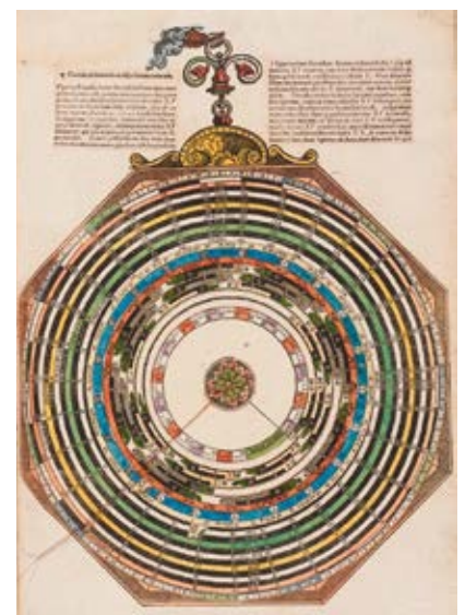
PETER APIAN Astronomicum Caesareum. Ingolstadt, 1540. Sold for CHF 660 000

David Robert's six-volume work with 238 colored lithographs of historical subjects from Palestine and Egypt, published in London between 1842 and 1849, fetched CHF 220 000 (lot 386).