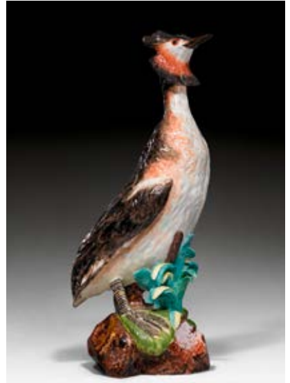
AUGUSTUS REX GREAT CRESTED GREBE, Meissen, circa 1734. Sold for CHF 144 000

The 1903 pencil and charcoal drawing by the Viennese artist Adolph von Menzel, depicting a couple on a bench in a park, was one of the top lots of the Auction for Old Master Drawings & Prints, and sold for CHF 9 600, i.e. above its estimate (lot 3514). Swiss works were also high in demand, in particular those by Alexandre Calame. His chalk on blue paper, depicting a mountain landscape in the vicinity of Bordighera, estimated at CHF 2 500 / 3 500, fetched CHF 9 600 (lot 3483).