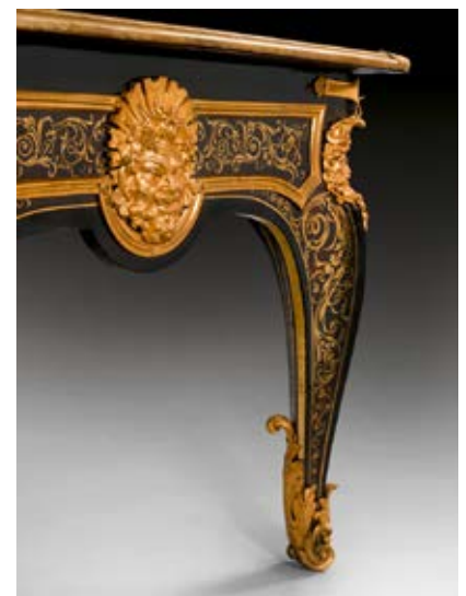
BUREAU-PLAT „AUX TÊTES DE SATYRE“, Régence, by A.C. BOULLE, Paris, circa 1720. Sold for CHF 3 million

Marble and bronze figures were likewise high in demand. The Greek bronze figure of Zeus from the 5th century B.C. was auctioned for CHF 294 000 (lot 1016). The ca. 80 cm tall marble figure of Actaeon with club, skin, horn and dog, which was created by Barthélemy Blaise in 1786, sold for CHF 180 000 (lot 1253).