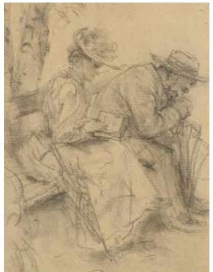
ADOLPH VON MENZEL Couple on a bench. 1903. Pencil and charcoal on paper. 16x9 cm. Sold for CHF 9 600