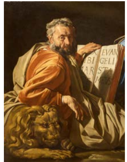
MATTHIAS STOMER The evangelists Mark and Luke. Oil on canvas. 113x154 cm. Sold for CHF 432 000

Once again, harmoniously composed paintings by the St. Petersburg artist Ivan Fedorovic Choultse were among the highlights of the auction for 19th century paintings. A winter landscape featuring Lake St. Moritz was sold for CHF 228 000, a sunset over the Adriatic changed hands for CHF 180 000 (lots 3225 and 3222). The “Portrait of a lady with coconut jewellery” by the Russian painter Konstantin Egorovich Makovsky was another top lot at the auction and fetched CHF 126 000 (lot 3202). The highest bid at the auction went to the oil “Les danseurs de Castel-Gandolfo” by Jean-Baptiste Camille Corot, created ca. 1855/60, which achieved CHF 256 000 (lot 3256).