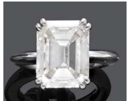
DIAMOND RING, MAJO FRUITHOF Sold for CHF 108 000