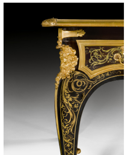
Detail Nr. 2 A.C. BOULLE BUREAU-PLAT «AUX TÊTES DE SATYRE», Régence, by A.C. BOULLE, Paris, ca. 1720.