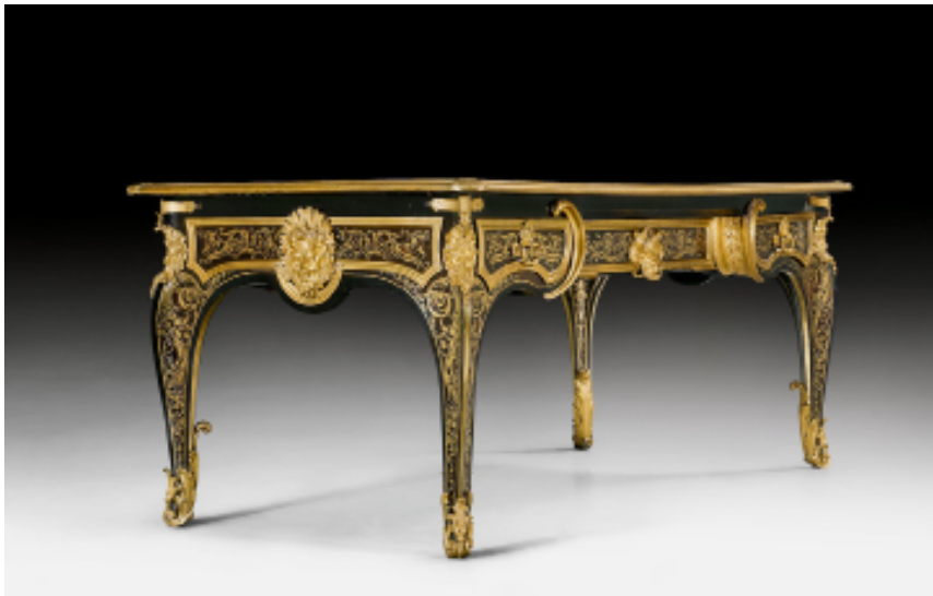
A.C. BOULLE BUREAU-PLAT «AUX TÊTES DE SATYRE», Régence, by A.C. BOULLE, Paris, ca. 1720. Estimate: CHF 1,5 to 2,5 mio.

Albeit his success, recurring financial difficulties, such as outstanding wage payments to his employees and tax problems, forced André-Charles Boule to sign over his company to his four sons in 1715, however without giving away the reins.