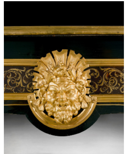
Detail Nr. 1 A.C. BOULLE BUREAU-PLAT «AUX TÊTES DE SATYRE», Régence, by A.C. BOULLE, Paris, ca. 1720.

The exclusive Bureau-Plats by André-Charles Boulle were already much desired among the most important exponents of his time. The list of original first owners therefore stretches from family members of King Louis XIV, to King Philipp V of Spain, the Prince of Conde, Cardinal Prince de Rohan, the financier family Bernard to the ministers of Louis XV, such as his infamous Treasurer, Abbot Joseph Marie Terray. The early popularity of such desks is also apparent in the numerous illustrations from the 18th century.