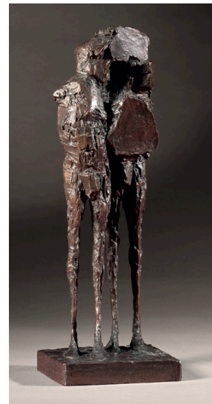
Elisabeth Frink, Assassins II , 1963, Bronze; Beaux Arts London

In order to broaden the audience at the BADA Fair, there are several initiatives to attract new visitors and collectors. One of the most positive has been the Interior Designers' Selection run by House & Garden. This year four acclaimed interior designers will each choose three highlights amongst the items displayed at the BADA Fair, and their Exhibitors will receive a showcard to denote the selected object. Similarly the programme of talks and events will cover themes from cross collecting to Hollywood Style - Jewellery and Fashion from 1929 to 1959 , appealing not just to antique aficionados but to a range of people from interior designers to jewellery enthusiasts.