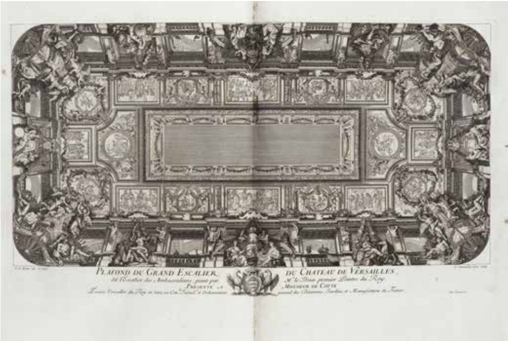
Charles Simonneau. Ceiling of the Great Staircase at Versailles Etching and burin 38.7 x 70.5 cm. Chalcographic copper plate printing

Such cartoons were commonly used between the sixteenth and nineteenth centuries, but few have reached our days. Those produced by Le Brun are the exception: three hundred and fifty cartoons in a store of three thousand drawings found at the artist’s studio, requisitioned and added to the royal collections after his death in 1690.