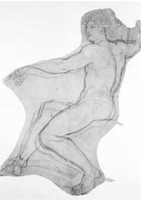
Charles Le Brun (1619-1690) Louis XIV nude, in profile facing left Black pencil, white chalk and incisions. 1.670 x 1.120 m

The paintings in the Hall of Mirrors enable us to follow, step by step, the artist’s working process, from the first small sketches, their pencil strokes embodying powerful movement, to the final drawings, which are the same size as the paintings themselves. Also conserved are the engraved copies of the overall work, produced for the purpose of making this artistic accomplishment known beyond French borders, adding to the monarch’s fame.