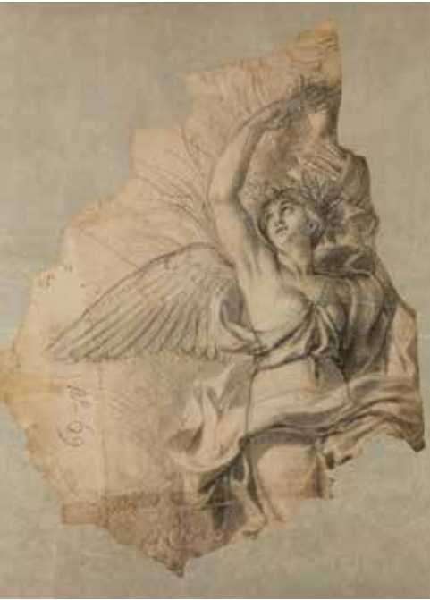
Charles Le Brun (1619-1690) A Victory dressed, with her right arm raised Black pencil, white chalk, gratification in black pencil and incisions. 2.040 x 1.570 m. Musée du Louvre

Le Brun surrounded the king by representatives from nations in the four continents, the kings of Antiquity, victories, cupids and the arts: a monumental composition to the honour and glory of the absolute monarch. The cartoons reveal that Le Brun worked on the Staircase of the Ambassadors to the last minute, retouching and improving his drawings.