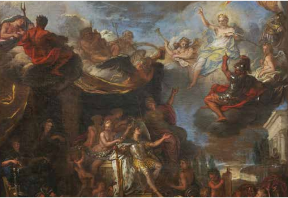
Charles Le Brun (1619-1690). The King Rules Alone (fragment) Oil on canvas. 1.030 x 0.990 m. Versailles, Musée national du château

In European painting, the figure of the king was traditionally represented by a mythological figure: Apollo, Hercules and so on. Le Brun, however, portrays the king himself, leading his armies to victory, wearing an ancient breastplate and a modern wig, in a dialogue with the gods and allegories. Two of the most important scenes on the ceiling are represented: the king’s decision to rule alone, and the war with Holland. One of the most famous episodes in this war, The Crossing of the Rhine in 1672 , is shown through cartoons exactly as they were found in Le Brun’s studio.