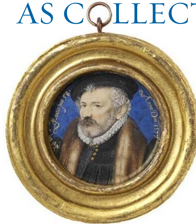
Front cover: Richard Hilliard, miniature by Nicholas Hilliard, 1576-7