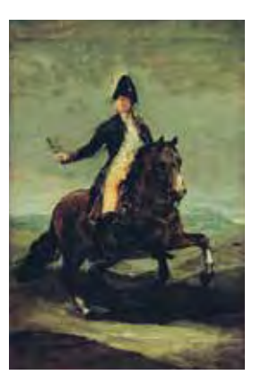
Attributed to Francisco José de Goya and Lucientes, Equestrian portrait of Ferdinand VII (sketch), circa 1808,oil on canvas, 42 x 28 cm