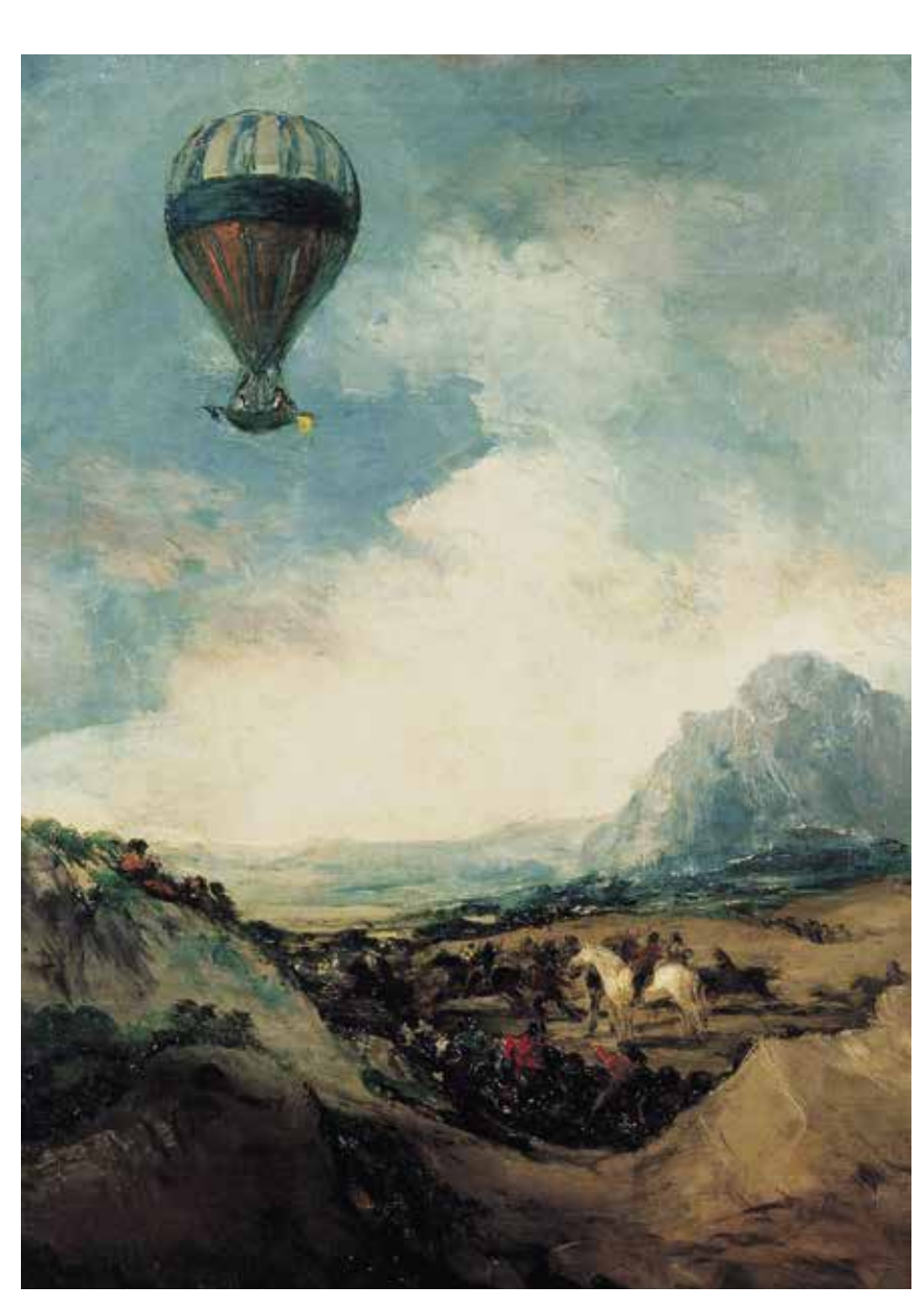
Attributed to Francisco José de Goya and Lucientes, The Balloon , after 1824 (?), oil on canvas, 105 x 84.5 cm

Nearly 90 works loaned by museums and private collections around the world (France, Germany, Hungary, Spain, Switzerland, UK, USA) will be on display in the Jacobins' Church (Église des Jacobins), an Agen architectural jewel and an emblematic place for the Museum's temporary exhibitions.