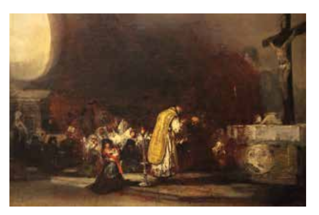
Attributed to Francisco José de Goya and Lucientes, The Churching , around 1819, oil on canvas, 53.7 x 77 cm