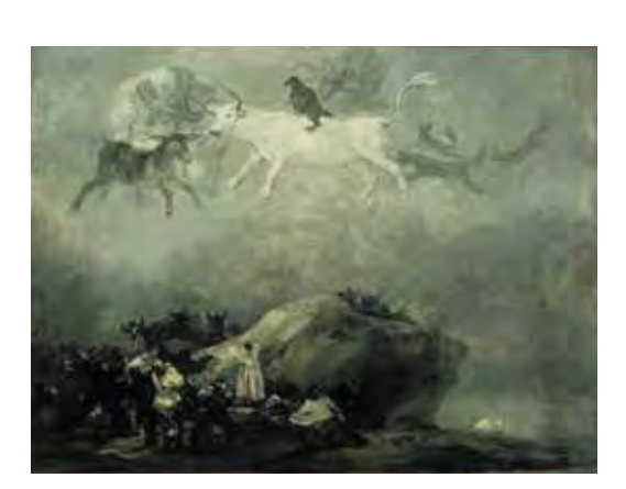
Attributed to Francisco José de Goya and Lucientes, Capricho, after 1824 (?), oil on canvas, 37.8 x 50 cm