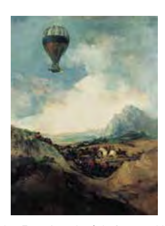
Attributed to Francisco José de Goya and Lucientes, The Balloon, after 1824 (?), oil on canvas, 105 x 84.5 cm