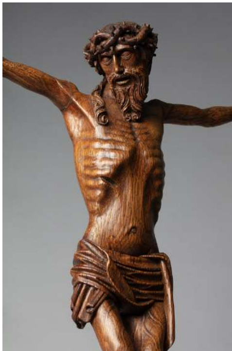
Christ on the Cross , Eastern Netherlands or Lower Rhine, c. 1500, Sam Fogg