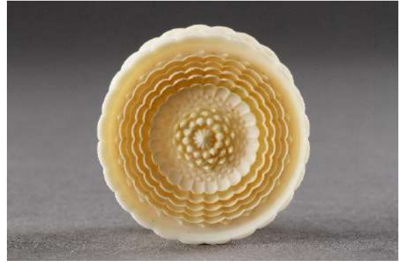
Joaquín Sorolla Y Bastida (1863-1923), Children in the Sea, 1908, oil on canvas, a very rare fine engine-turned Box & Cover with the Tudor Rose attrib. to the 'Master Turner' to the Court of Henry VIII, c. 1540-60, ivory, Finch & Co

Among exhibitions and auctions to visit in person during LAW Winter this December: