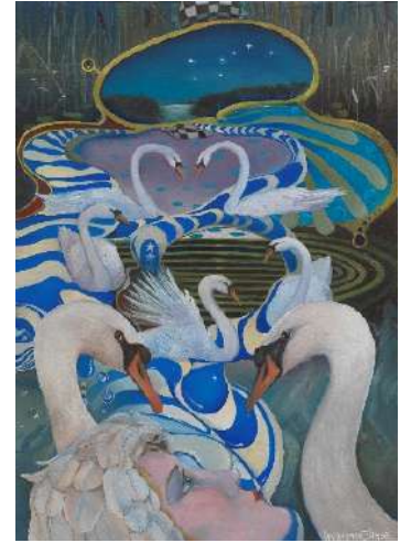
Marco Piemonte (b. 1976), Three little Friends (number 2) , 2023, oil on canvas, Clase Fine Art ; Rory Hutton, Gertrude's Garden , original print, Shapero Modern ; Saul Jefferson, Seven Swans A-Swimming , oil on panel, David Messum Fine Art