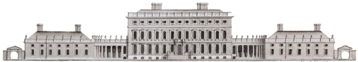
Castletown House, County Kildare